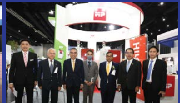
THAI HIRAKAWA CO., LTD.