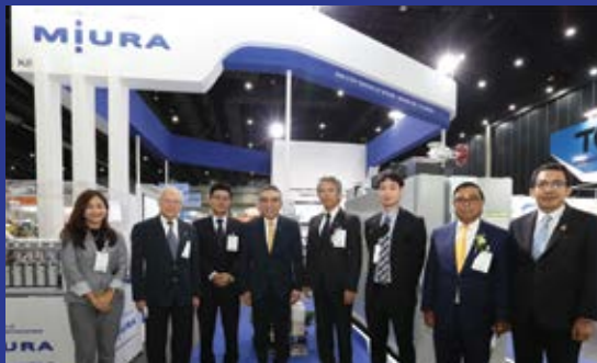
MIURA INDUSTRIES (THAILAND) CO., LTD.