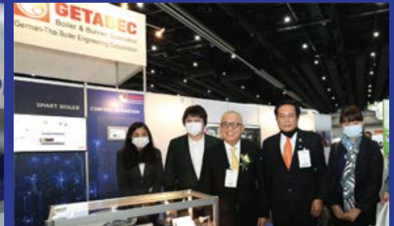
GETABEC PUBLIC COMPANY LIMITED