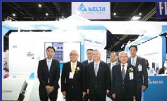
DELTA ELECTRONICS (THAILAND) PCL.