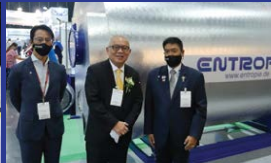
BOONYIUM AND ASSOCIATES LIMITED