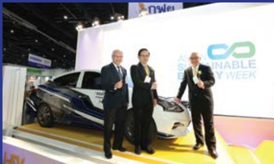
ELECTRICITY GENERATING AUTHORITY OF THAILAND (EGAT)

Together, we have overcome the challenges which have resulted in the 2020 show a major success!